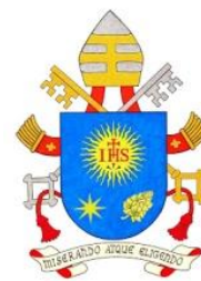
Pope Francis Vatican City State