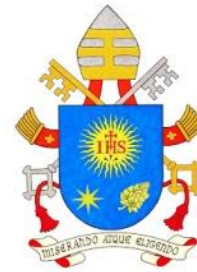
Pope Francis Vatican City State