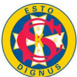
Knights of Columbus Squires Youth Organization