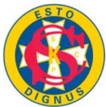
Knights of Columbus Squires Youth Organization