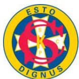
Knights of Columbus Squires Youth Organization