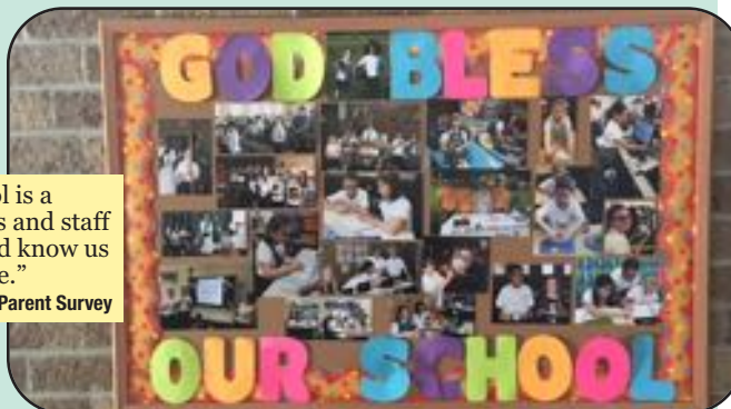
Both churches have new St. Bernard School bulletin boards in the vestibules. Check out the photos and learn more about our parish school at www.sbsenfield.org .

You can reach her at admissions@sbsenfield.org .