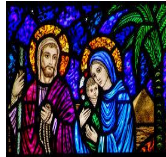
THE HOLY FAMILY OF JESUS, MARY AND JOSEPH

Religious Ed classes, coffee and donuts, and Sunday Morning Bible Study all will resume next Sunday after 8:30 am Mass. All are invited each week.