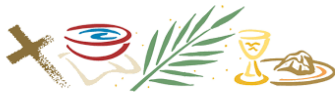
Our Lenten Worship Schedule

Saturday: 5:00pm at St. John's Sunday: 8:30am at St. John's 10:30am at St. Mary's