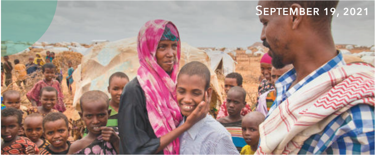
Migrants and Refugees Section/Vatican