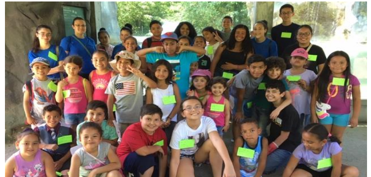
Our VBS students enjoying a fun day at the EcoTarium