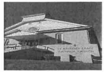
St. Benedict Labre