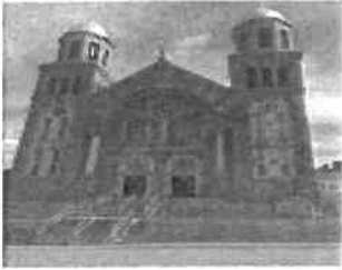
St. Mary Star of the Sea