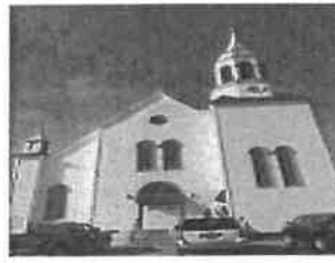
St. James the Greater