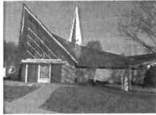
St. Edward the Confessor