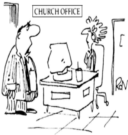
"If telemarketers call, invite them to church."