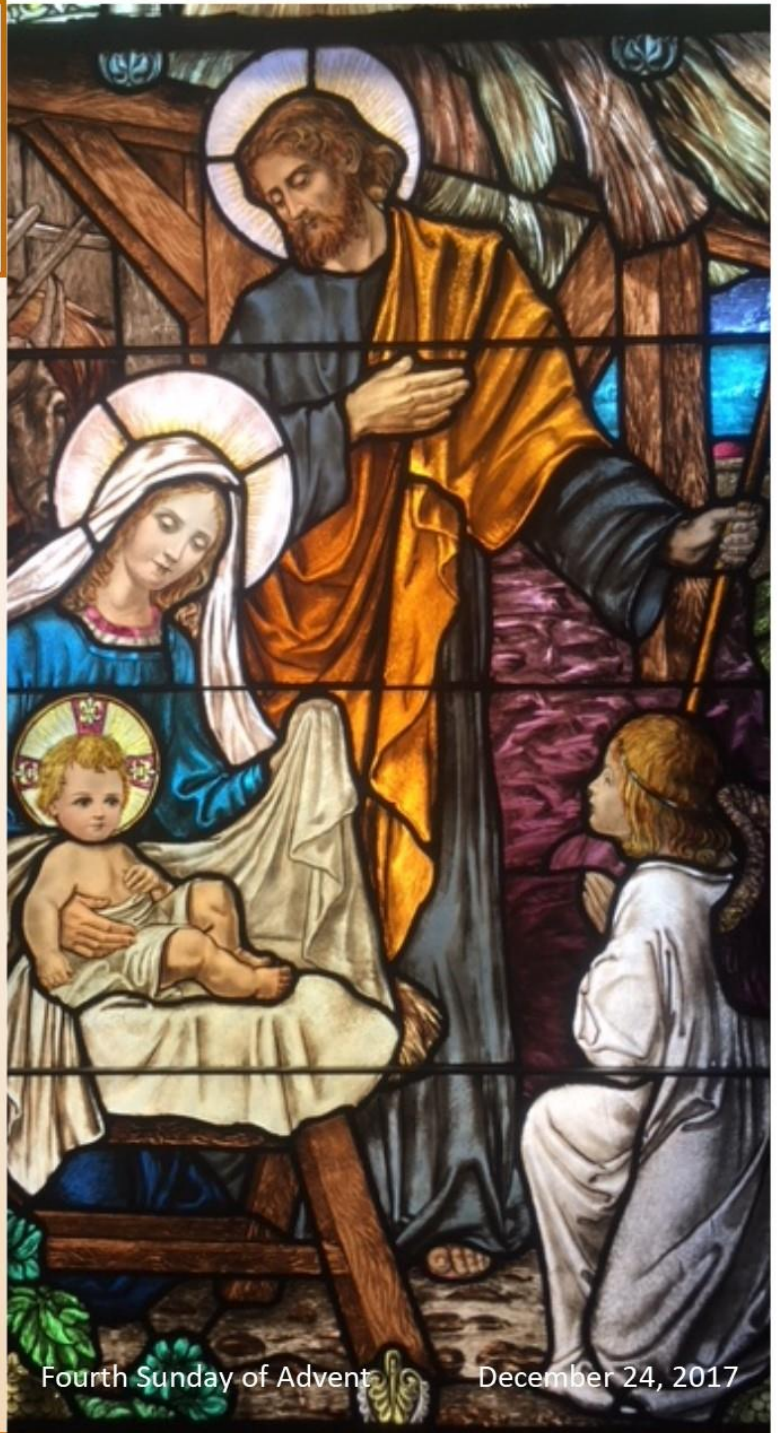
Fourth Sunday of Advent December 24, 2017

PSR Classes: Second Sunday of the Month at 8:30 a.m. at St. Joseph School Building Food Pantry: Mondays & Fridays from 9-11 a.m. Parish Registration and Membership for St. Joseph & St. Anne Churches—New Families Are Welcome and Are Asked to Register at Their Earliest Convenience.