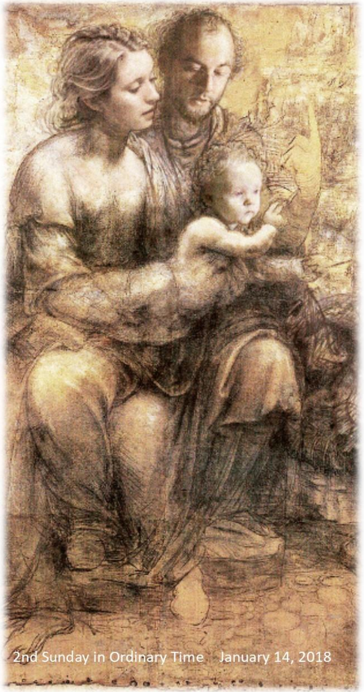
2nd Sunday in Ordinary Time January 14, 2018