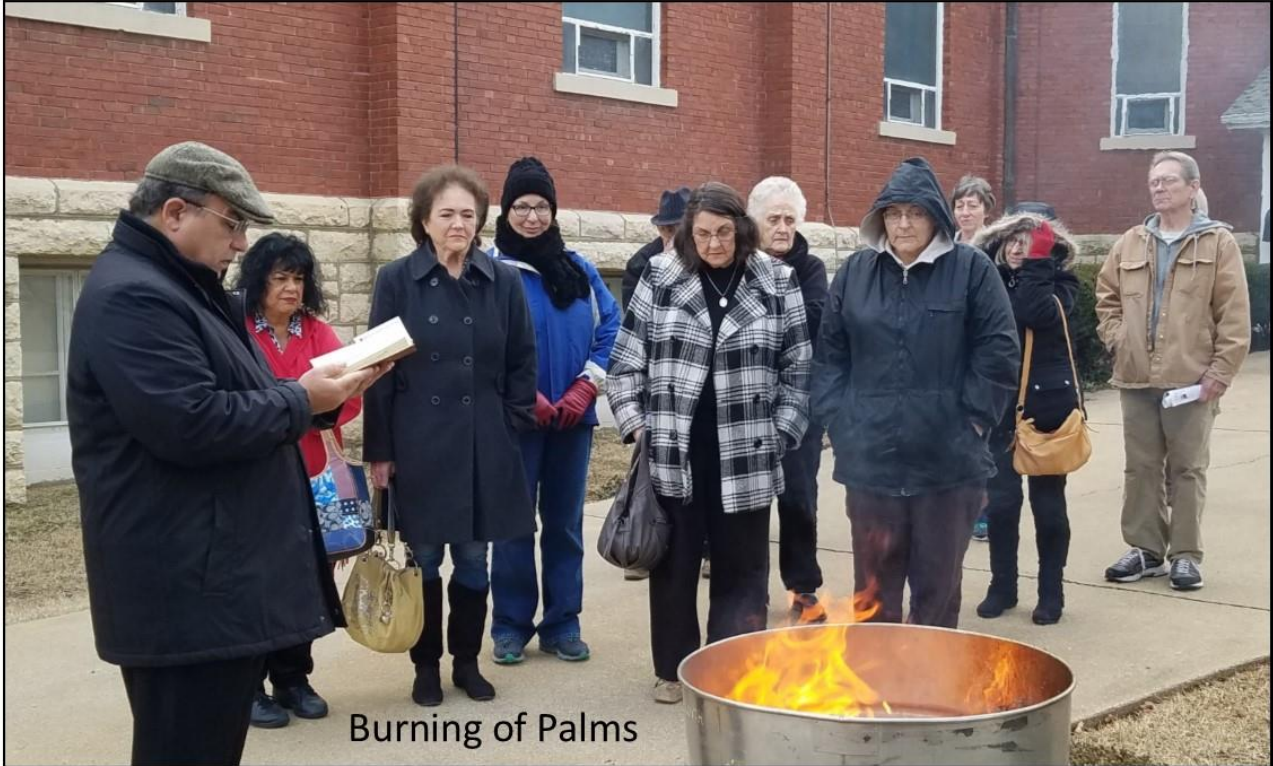
Burning of Palms

15 St. Joseph St., Bonne Terre, MO February 25, 2018