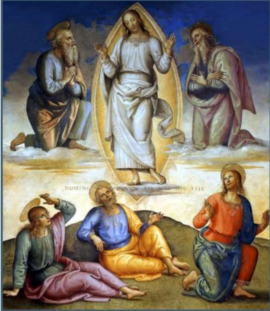
Transfiguration Pietro Perugino 1496

MARRIAGES: Arrangements Must Be Made With the Pastor 6 Months Prior to Proposed Marriage