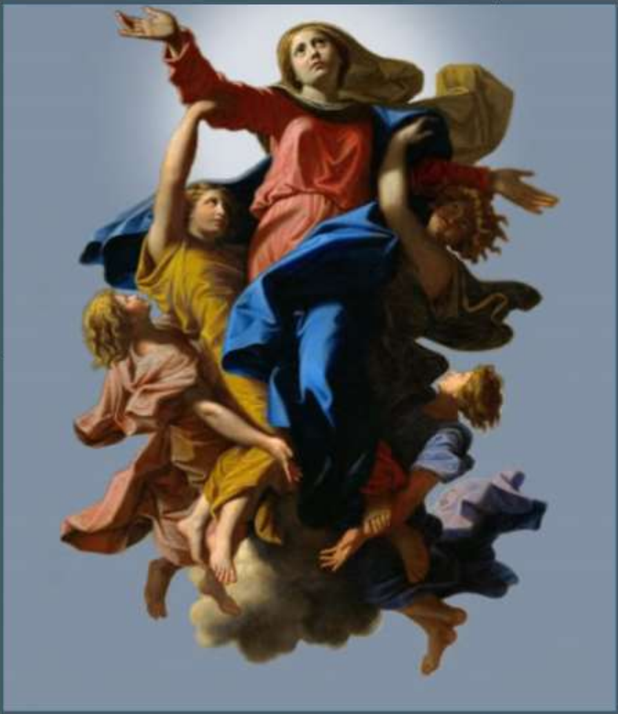
The Assumption of Mary August 15

MASS SCHEDULE: WEEKDAYS: 8:00 am (Monday— Friday) SATURDAYS: 5:00 pm SUNDAY: 10:00 am HOLYDAYS: 8:00 am & 6:00 pm on Holyday ROSARY: Thursday after Mass Saturday at 4:30 pm PERPETUAL HELP DEVOTIONS: Tuesday after Mass EUCCHARISTIC ADORATION: First Tuesday of the Month Following 8:00 am Mass with Benediction at 10:00 am RECONCILIATION: Saturday From 4:00—4:45 pm BAPTISMS: First Sunday of Each Month by Appointment With Pastor MARRIAGES: Arrangements Must Be Made With the Pastor 6 Months Prior to Proposed Marriage