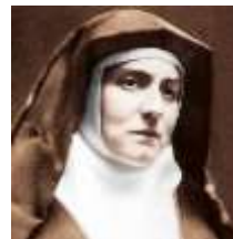
St. Teresa Benedicta of the Cross (Edith Stein)

Please log onto www.ruralking.com/churchweek , click on the Organization Search tab , search for the state of Missouri and click onto St. Joseph Church, Bonne Terre, MO, and then use the click on tab to enter Receipt Information . Thank you!