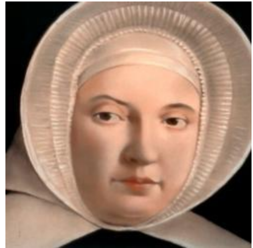
St. Emily de Vialar 1797 – 1856

I believe in one God, the Father almighty, maker of heaven and earth, of all things visible and invisible. I believe in one Lord Jesus Christ, the Only Begotten Son of God, born of the Father before all ages. God from God, Light from Light, true God from true God, begotten, not made, consubstantial with the Father; through him all things were made. For us men and for our salvation he came down from heaven, and by the Holy Spirit was incarnate of the Virgin Mary, and became man. For our sake he was crucified under Pontius Pilate, he suffered death and was buried, and rose again on the third day in accordance with the Scriptures. He ascended into heaven and is seated at the right hand of the Father. He will come again in glory to judge the living and the dead and his kingdom will have no end. I believe in the Holy Spirit, the Lord, the giver of life, who proceeds from the Father and the Son, who with the Father and the Son is adored and glorified, who has spoken through the prophets. I believe in one, holy, catholic and apostolic Church. I confess one baptism for the forgiveness of sins and I look forward to the resurrection of the dead and the life of the world to come. Amen.