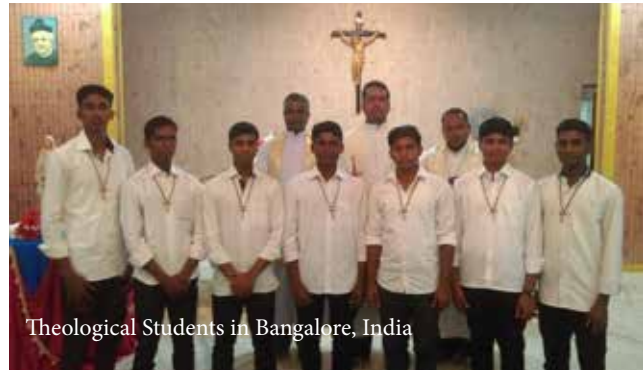
Theological Students in Bangalore, India

After mature consultation with my friends and supporters in the Catholic solidarity agencies, we have decided to attempt a project based on the formal request of our DPP Council to seek funding for the twenty-six Indian Theology students and the four Filipinos in Manila. The first project was