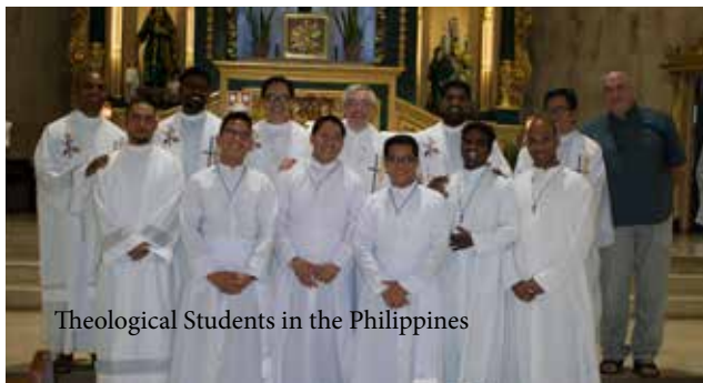
Theological Students in the Philippines