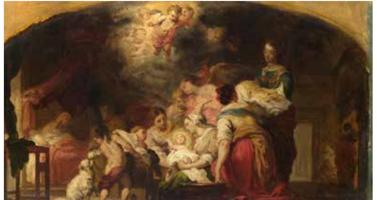
Happy Birthday to our Most Blessed Mother