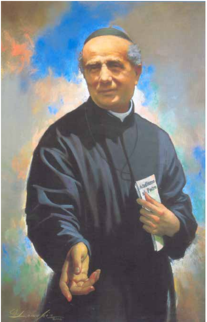
Blessed Louis Guanella