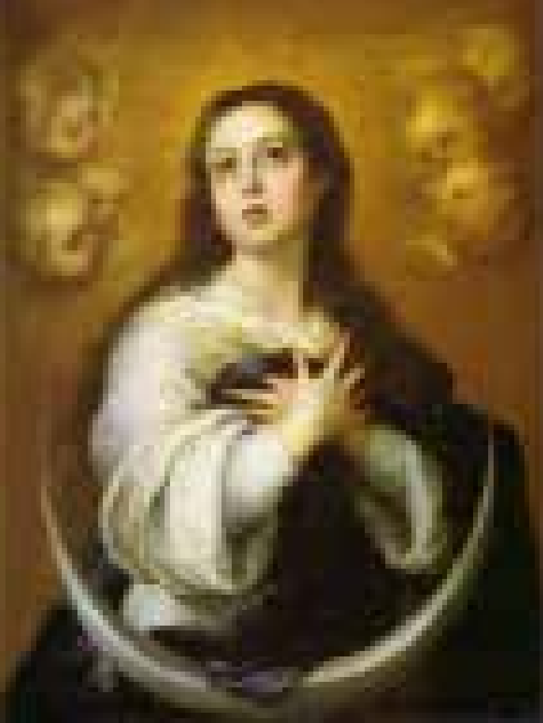
Immaculate Conception Patroness of the United States