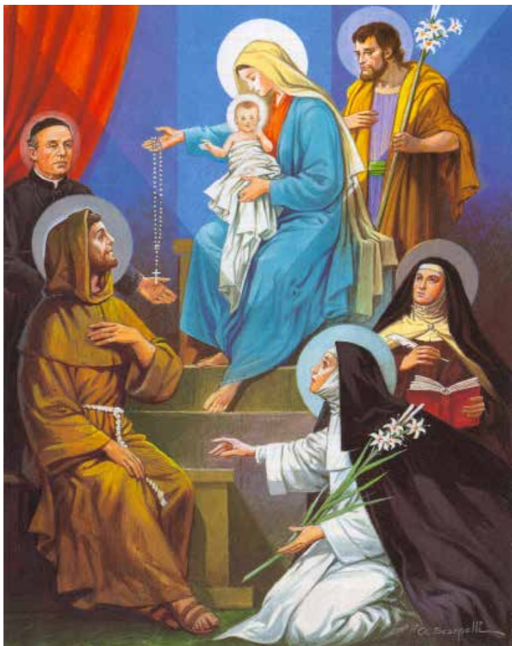
Our Lady of the Rosary with St. Joseph, St. Teresa of Avila, St. Catherine of Siena, St. Francis of Assisi and Blessed Louis Guanella