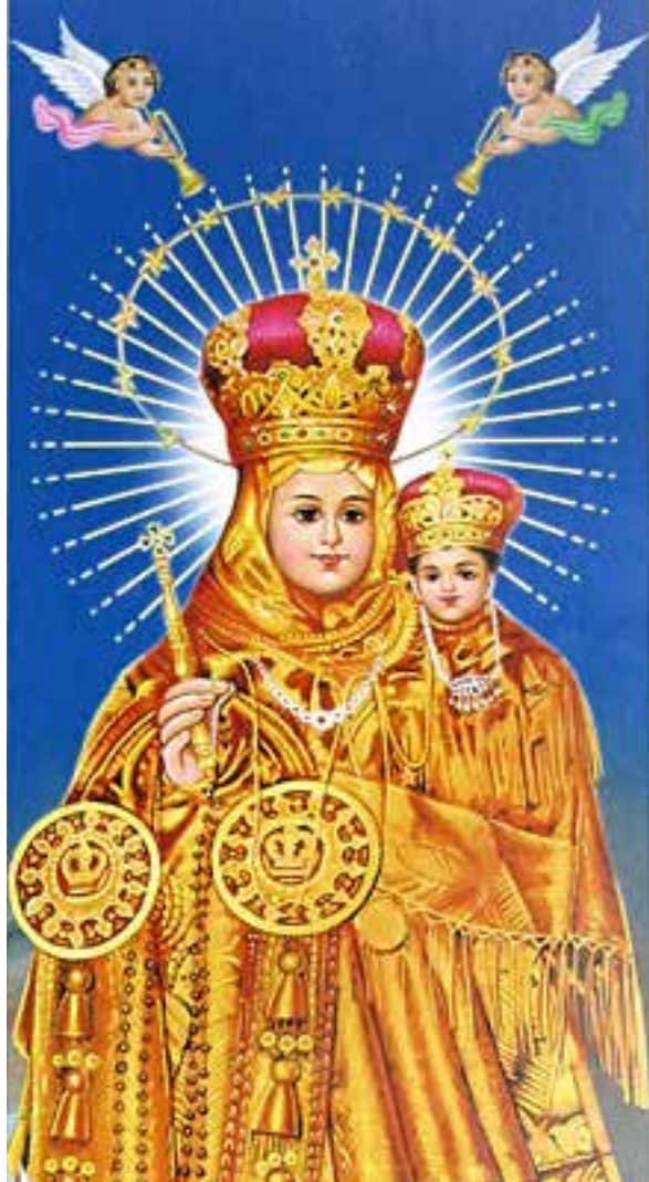
Our Lady of Veilankanni Patroness of India