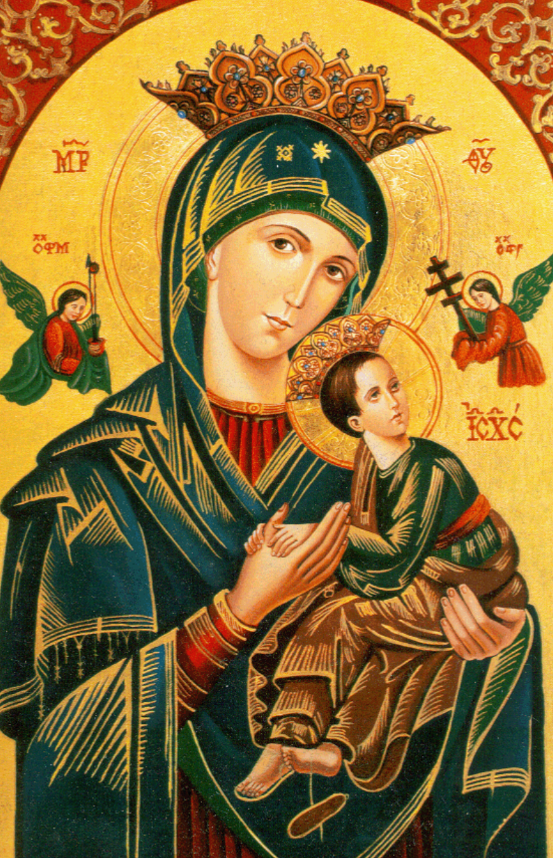
Our Lady of Perpetual Help Dearest Mother of the Filipinos