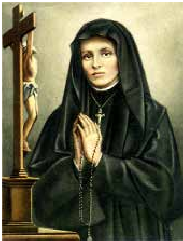
Blessed Clare Bosatta