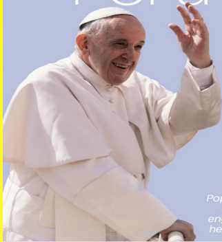
Pope Francis has called for a participative process, engaging all the faithful, to help prepare for the Synod.

Pope Francis will open a three-year synodal process in October. It will involve consultations and discernment and culminates with the XVI Ordinary General Assembly of the Synod of Bishops in Rome in October 2023.