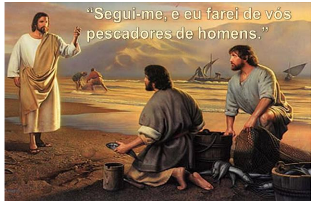
"Me siguió, y voy a hacer que los Pescadores de los hombres"

While the crowd was pressing in on Jesus and listening to the word of God, he was standing by the Lake of Gennesaret. He saw two boats there alongside the lake; the fishermen had disembarked and were washing their nets. Getting into one of the boats, the one belonging to Simon, he asked him to put out a short distance from the shore. Then he sat down and taught the crowds from the boat. After he had finished speaking, he said to Simon, "Put out into deep water and lower your nets for a catch." Simon said in reply, "Master, we have worked hard all night and have caught nothing, but at your command I will lower the nets." When they had done this, they caught a great number of fish and their nets were tearing. They signaled to their partners in the other boat to come to help them. They came and filled both boats so that the boats were in danger of sinking. When Simon Peter saw this, he fell at the knees of Jesus and said, "Depart from me, Lord, for I am a sinful man." For astonishment at the catch of fish they had made seized him and all those with him, and likewise James and John, the sons of Zebedee, who were partners of Simon. Jesus said to Simon, "Do not be afraid; from now on you will be catching men." When they brought their boats to the shore, they left everything and followed him.