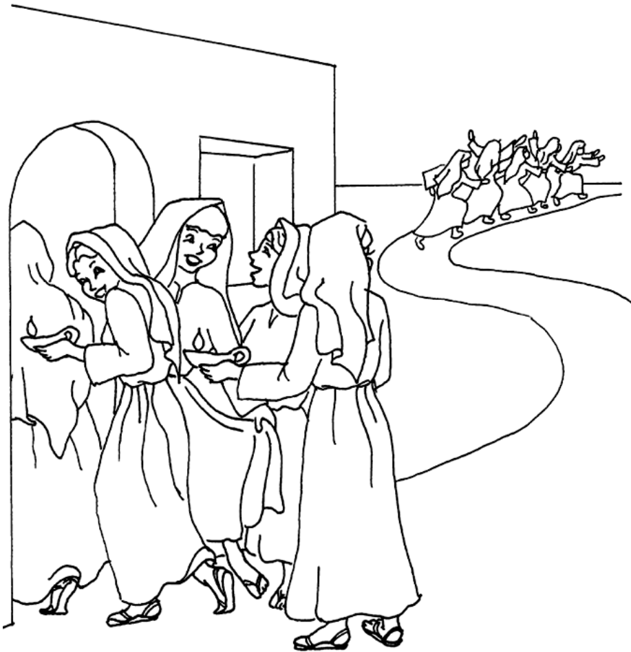
The Parable of the Ten Bridesmaids Matthew 25:1-13