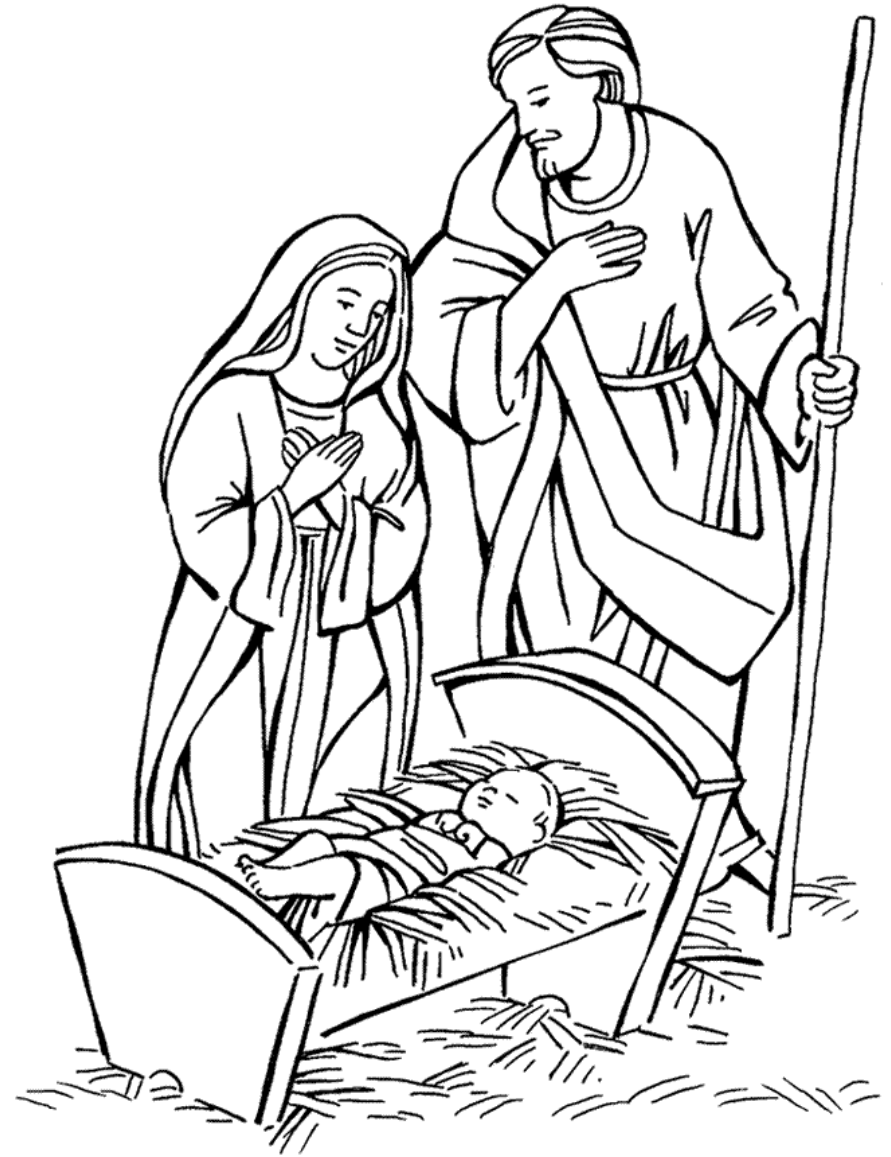
The Word became flesh and made his dwelling among us. John 1:14