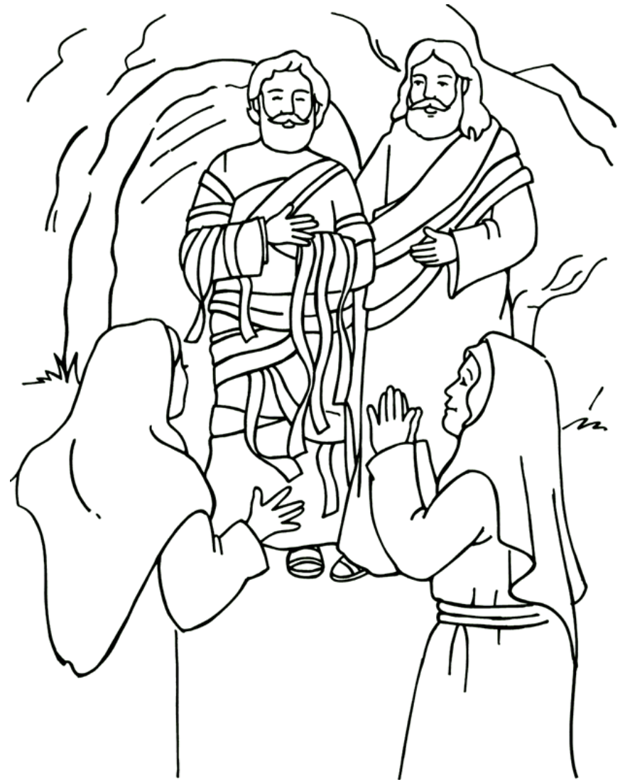
Jesus Raises Lazarus