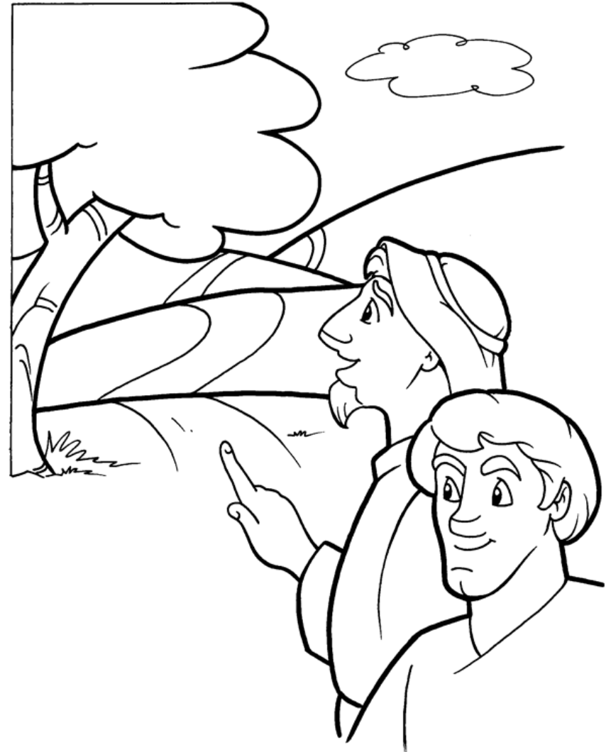
The Road to Emmaus