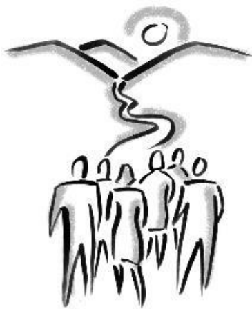
The Road to Emmaus