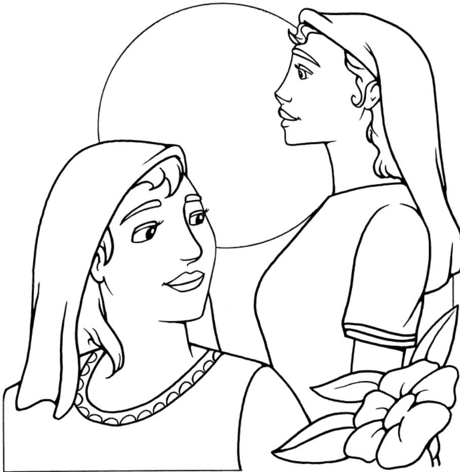
Leah and Rachel

Now Laban had two daughters; the name of the older was Leah, and the name of the younger was Rachel.