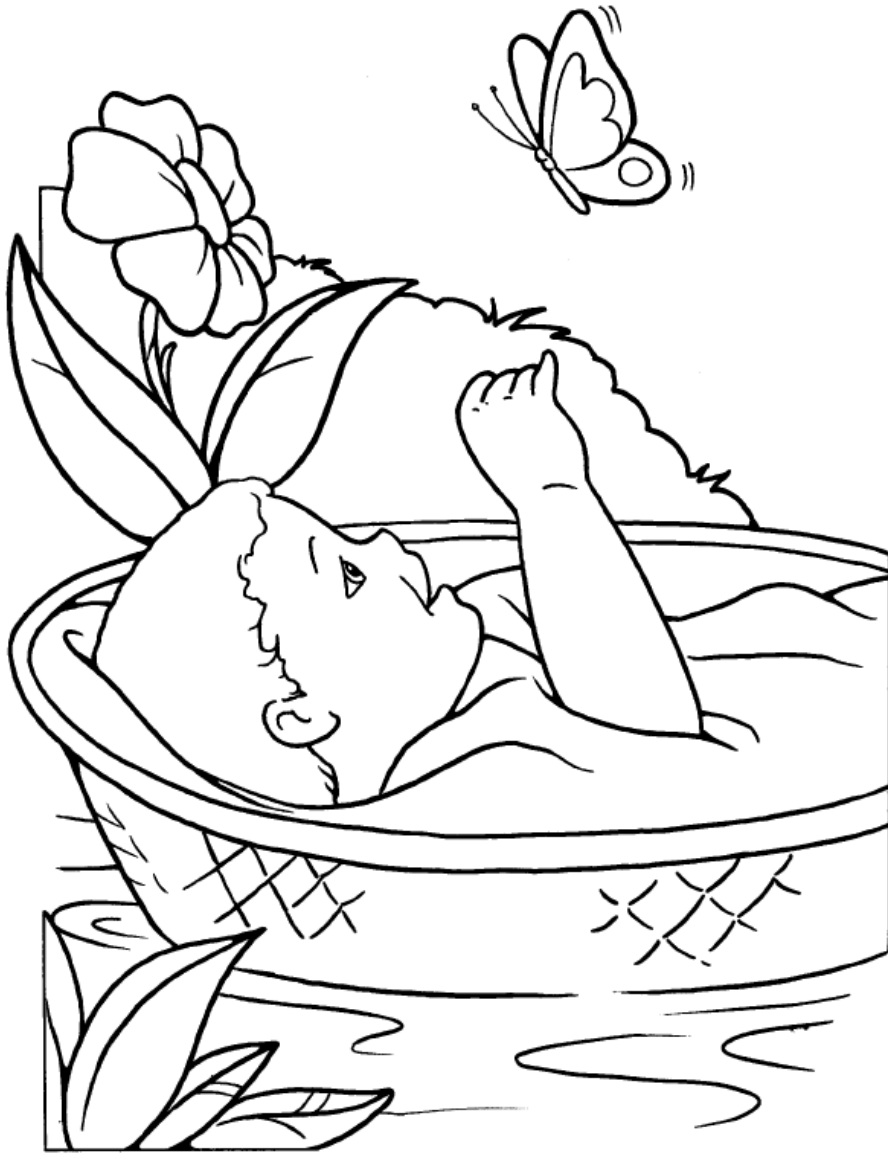
The Baby Moses by the River