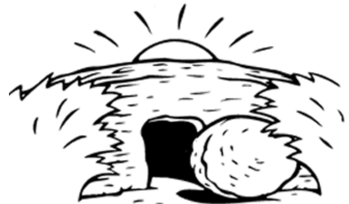
"He has risen! He is not here." Mark 16:6