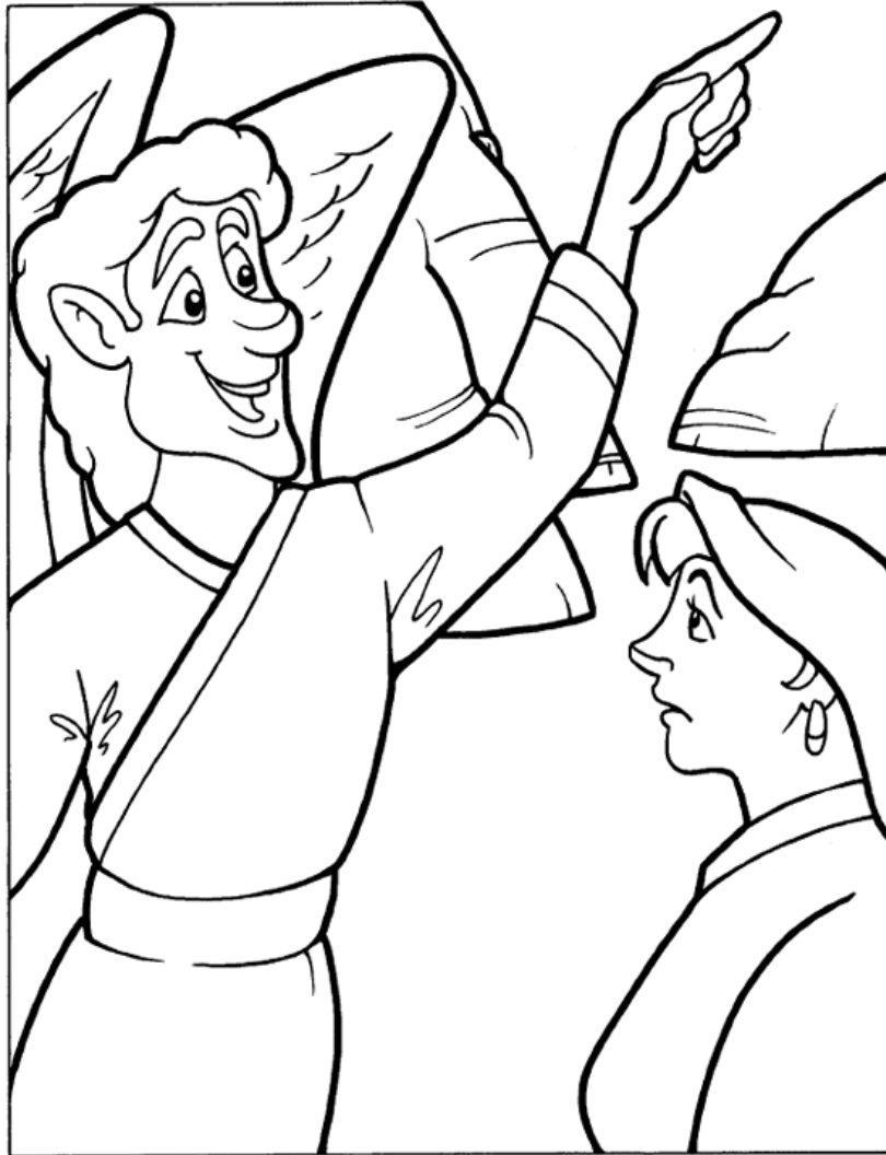
"He is not there, he is risen" Mark 16:6