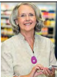
GPS Mobile Above

No Contract • No Fees • Easy Setup • md-medalert.com CALL 800-890-8615