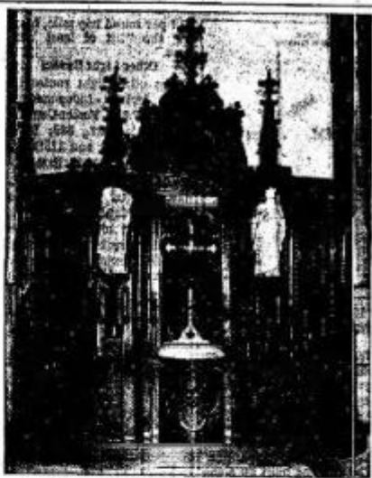
Buscher carved confessionals from butternut wood as well as the main altar and its staturary. Buscher's nephew, Sebastian, carved the two statues.