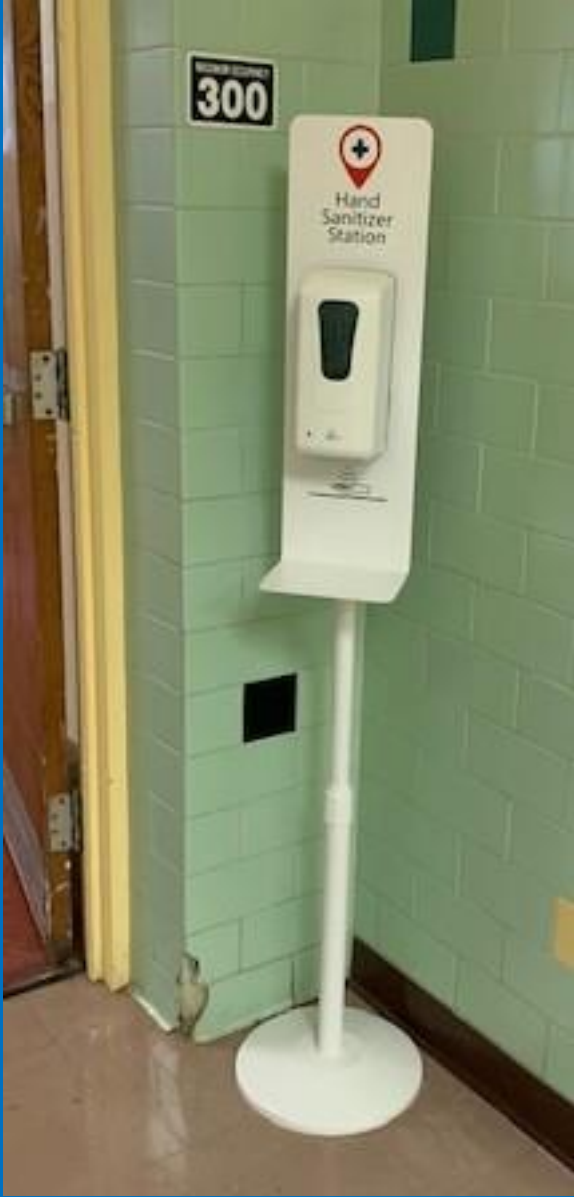
Hand Sanitizer Stations