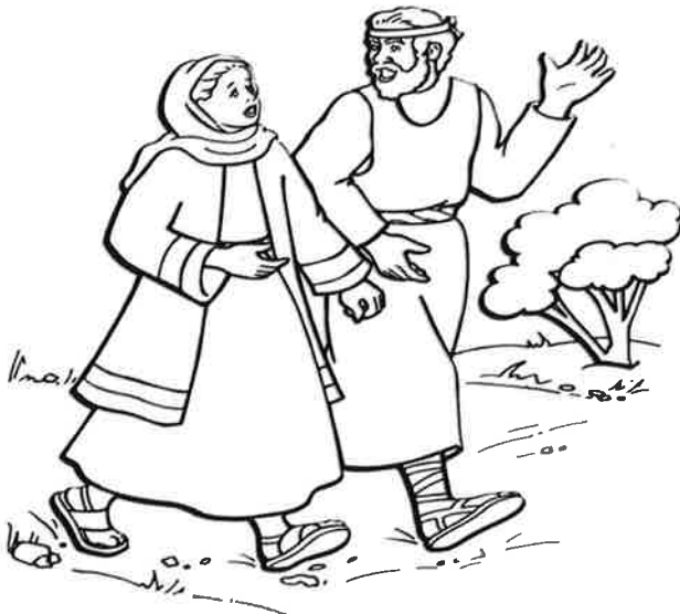
Two of Jesus' disciples were going to a village . . . called Emmaus, and they were conversing about all the things that had occurred. Luke 24:13, 14