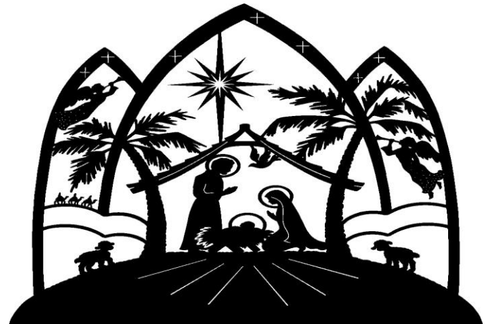
Christmas Masses at Nativity

Matthew's Festival Singers join 7 of our finest Cathedral lector/voices in joyful anticipation of the coming Messiah. After the music all are invited to the Great Hall for Christmas caroling, Christmas sweets, eggnog and wassail. The evening is free and open to the public. For those who are able, a suggested donation of $20 is requested. (please note this not the Sunday Mass.) METRO: Farragut North or Dupont Circle South. A gem of the Archdiocese & our Cathedral Home, the Cathedral is also considered a "National Treasure" of great music, art and architecture. St. Matthew is the seat of the Archbishop and where the funeral Mass of President John F. Kennedy was held; Pope Francis addressed the US Bishops at St. Matthews during his Apostolic Visit to the USA. His first in his life. For more on St. Matthews visit https://www.stmatthewscathedral.org/