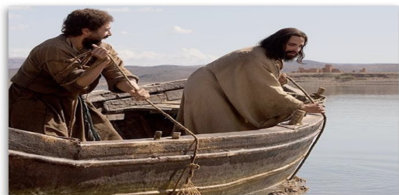
“Put out into deep water.”