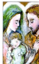
Pray for Unborn Human Life

I, _____, will pray daily: Jesus, Mary and Joseph I love you very much. I beg you to spare the life of the unborn child that I have spiritually adopted who is in danger of abortion. -- Archbishop Fulton J. Sheen