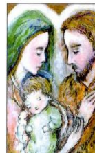
Pray for Unborn Human Life

I, _____, will pray daily: Jesus, Mary and Joseph I love you very much. I beg you to spare the life of the unborn child that I have spiritually adopted who is in danger of abortion. -- Archbishop Fulton J. Sheen