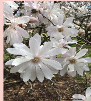
Magnolias in Highland Park

So far, it seems like we are going to be graced with some spring weather, or at least what passes as spring weather in Rochester. If you are like me, you may welcome any sunshine and warmer reprieve from the interminable cold and cloudiness that characterized our weather from November to March. This spring like weather also is helpful, because it makes it easier to get outdoors and witness all of creation bursting forth with new life in this Easter season. For me, the appearance of blossoms and leaves on trees and blooming flowers is creation joining in our glorious and joyful shouts of "Alleluia!" to our Risen Lord Jesus Christ.