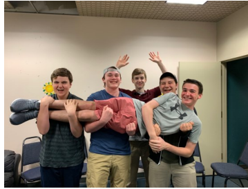
The NCYC Pilgrims wish to thank everyone for their generous support at the bake sale and "Take Stock in our Youth" weekend!

If you have not yet given, and would like to, you can still place a donation in the collection basket clearly