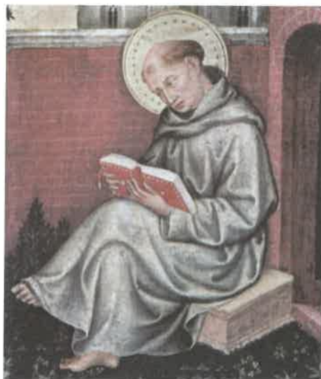
DETAIL (THOMAS AQUINAS) FROM VALLE ROMITA POLYPTICH BY GENTILE DA FABRIANO (CIRCA 1400)

—The Redemptorists Sundaybulletin@Liguori.org