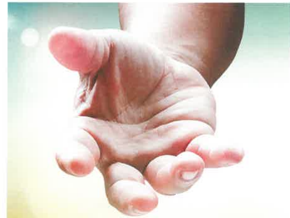
A particular focus of the evangelizing Catholic ought to be those who have been baptized but who live outside the Christian life.

What about nonpracticing Catholics? Yes, again! A particular focus of the evangelizing Catholic ought to be those who have been baptized but who live outside the Christian life. We already know that a large number of the baptized have not formally repudiated their baptism but do not live in accordance with it. They resist the idea of evangelization out of indifference or a hostility based on the belief that he or she is one of the family, but is “in the know” and no longer believes.