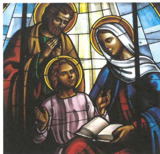
HOLY FAMILY / IMMACULATE CONCEPTION CATHEDRAL, EAST TIMOR