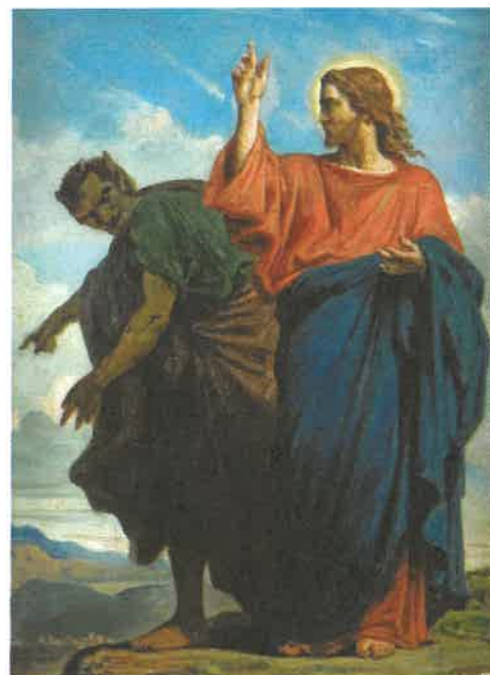
THE TEMPTATION OF CHRIST BY THE DEVIL BY FELIX JOSEPH BARRIAS, 1860

However, unlike the change in the Italian Lord's Prayer that will appear in their third edition of The Roman Missal , no immediate plans have been made to change the wording in English-speaking countries.