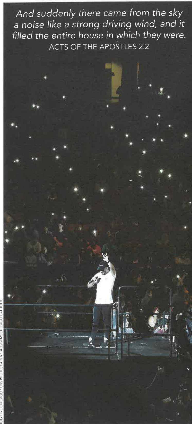
HOLY FIRE CHICAGO