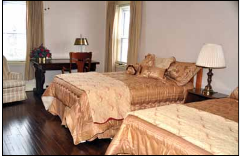
Garden Room: Two double beds • Spacious, modern bath with separate tub and a separate shower (7 heads!) with 1931 fixtures.