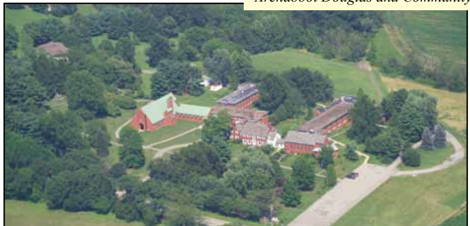
An aerial view of the monastery.