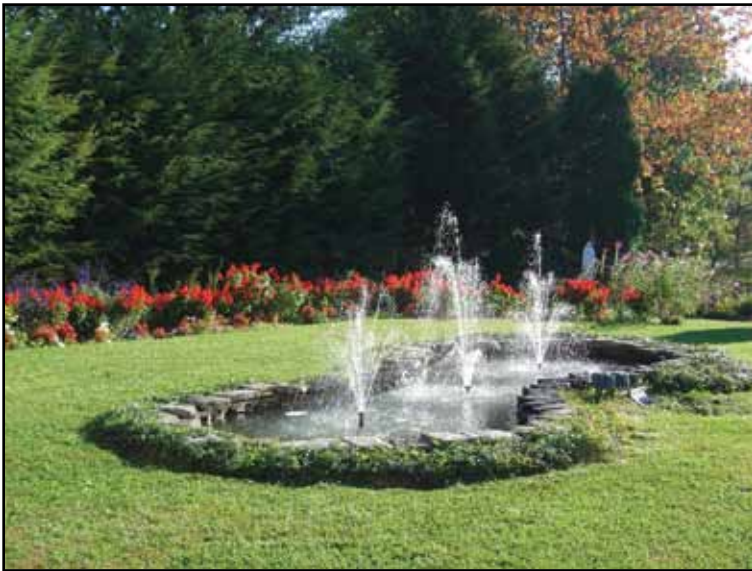
Enjoy the beautiful grounds of St. Emma Monastery.