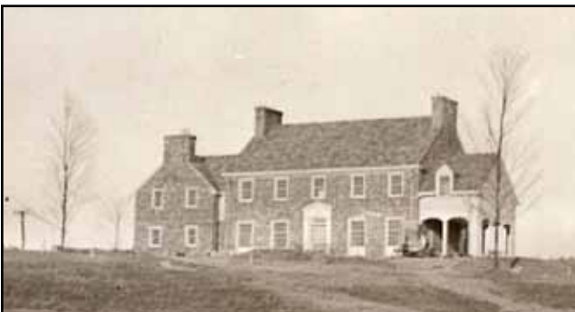
The Robertshaw House when it was first constructed, 80 years ago.

Please use the enclosed envelope to send us your prayer requests