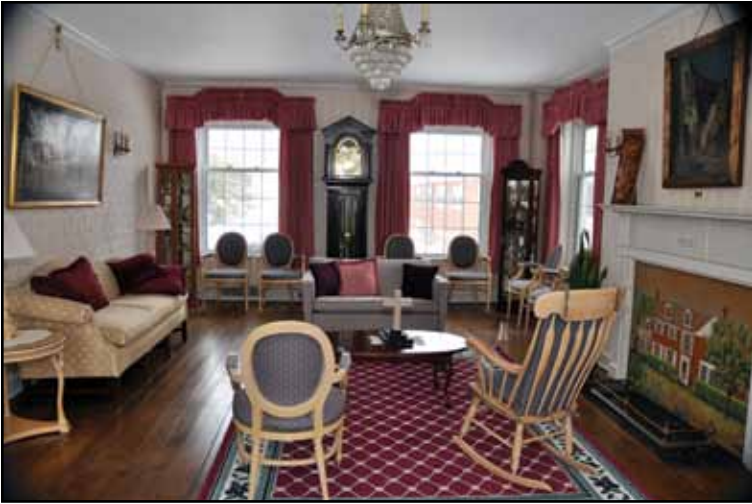
Living Room: Board game corner • Gas fireplace • Air-conditioned.