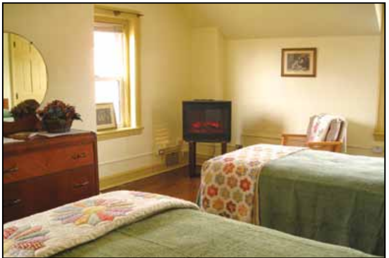
Emma Room: Two single beds • Spacious hall bath • Electric fireplace.