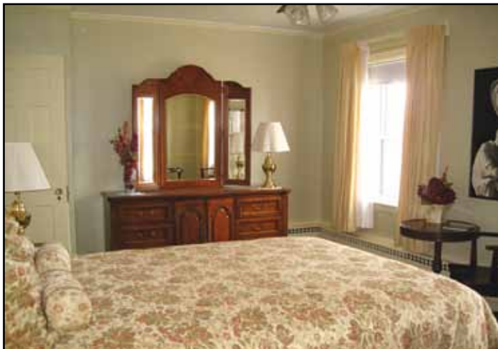
Robertshaw Suite: Queen-size bed • Spacious, modern bath with 1931 fixtures • Sitting room w/gas fireplace • Sleeper sofa (if needed)