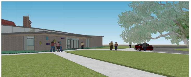
Drop off and Magnolia Tree