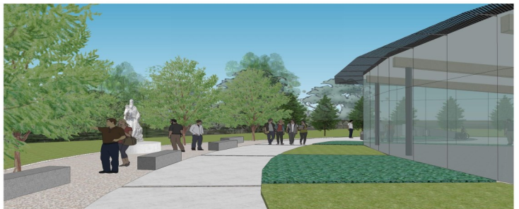
St. Peter Statue and Seating Area