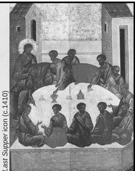
Last Supper icon (c.1410)