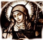
St Gertrude Prayer for Souls of Purgatory

Daniel 12:1-3 Hebrews 10:11-14, 18 Mark 13:24-32